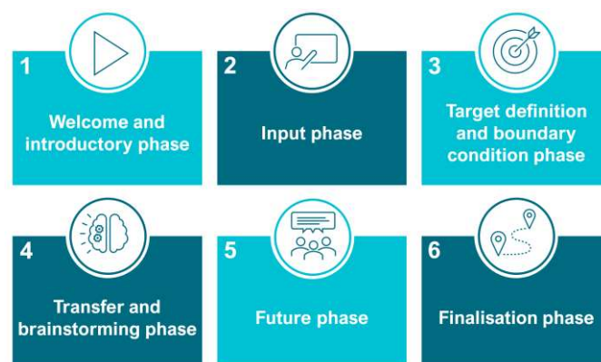
Figure 1: Overview of the workshop phases

subsequent Future Phase (phase 5), the preferred nudges selected by the team are further elaborated. The ideas are prepared for implementation, and feedback is subsequently collected from the workshop participants. Figure 1 provides an overview of the workshop structure.