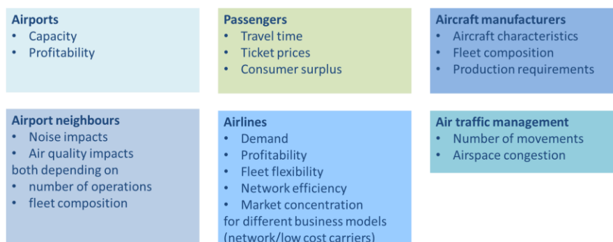
Figure 3: Aviation stakeholders affected by the REIVON approaches and related impacts

The AERO-MS tool will be used to model the different REIVON scenarios, in particular, the number of operations and impacts on various stakeholders including air transport passengers (impacts on travel time and ticket prices), airlines (impact on passenger km transported and operating revenues) and aircraft manufacturers (impact on fleet size and new production requirements).